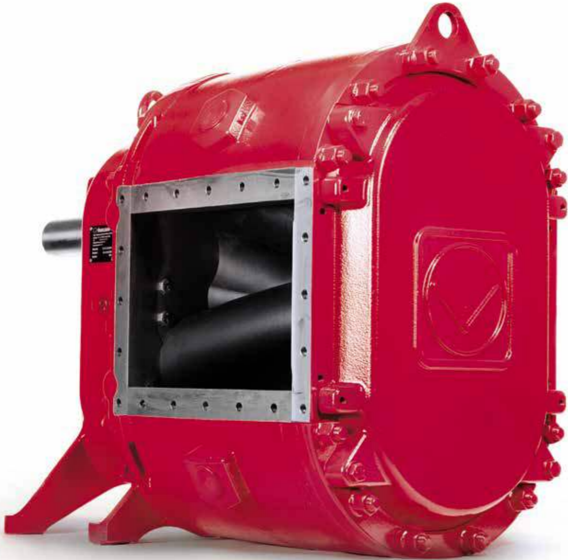
Service- and maintenance-friendly: the VX-series rotary lobe pumps

Vogelsang rotary lobe pumps: The efficient choice for a wide variety of conveying tasks